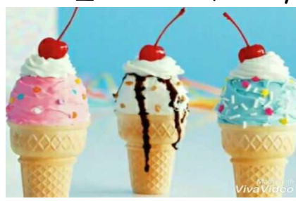
I like_ice cream, candys, fruits, chocolate and carrots.____